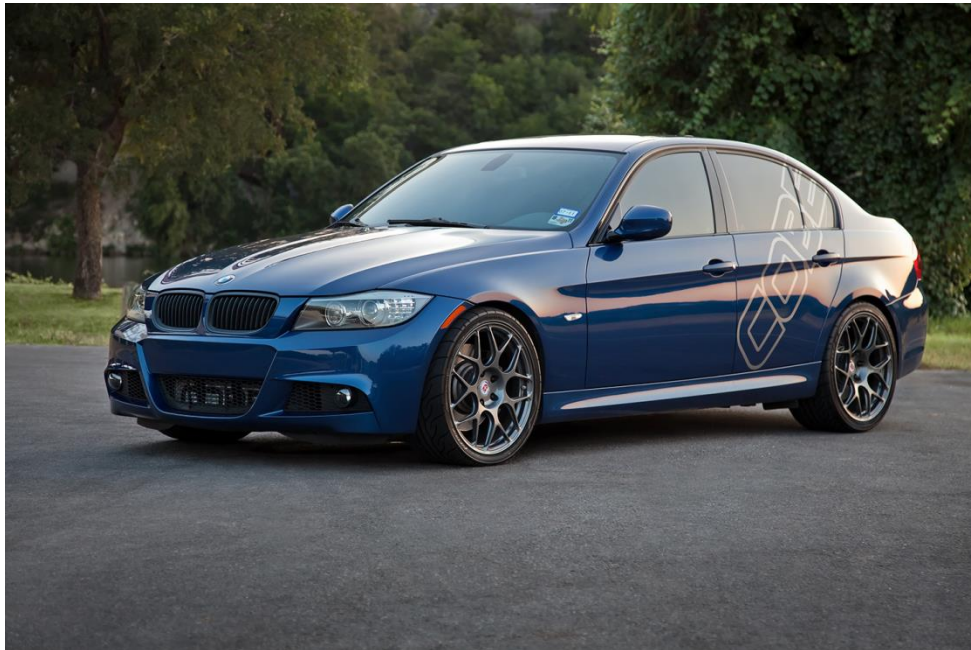
Table Descriptions and Tuning Tips