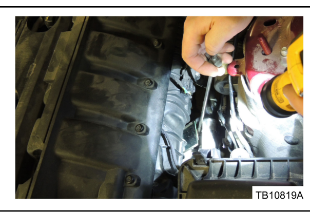
Figure 1 - Article 15-0192

1. Check the part tag on the crankcase vent oil separator by placing a mirror in front of the left motor mount. (Figure 1)