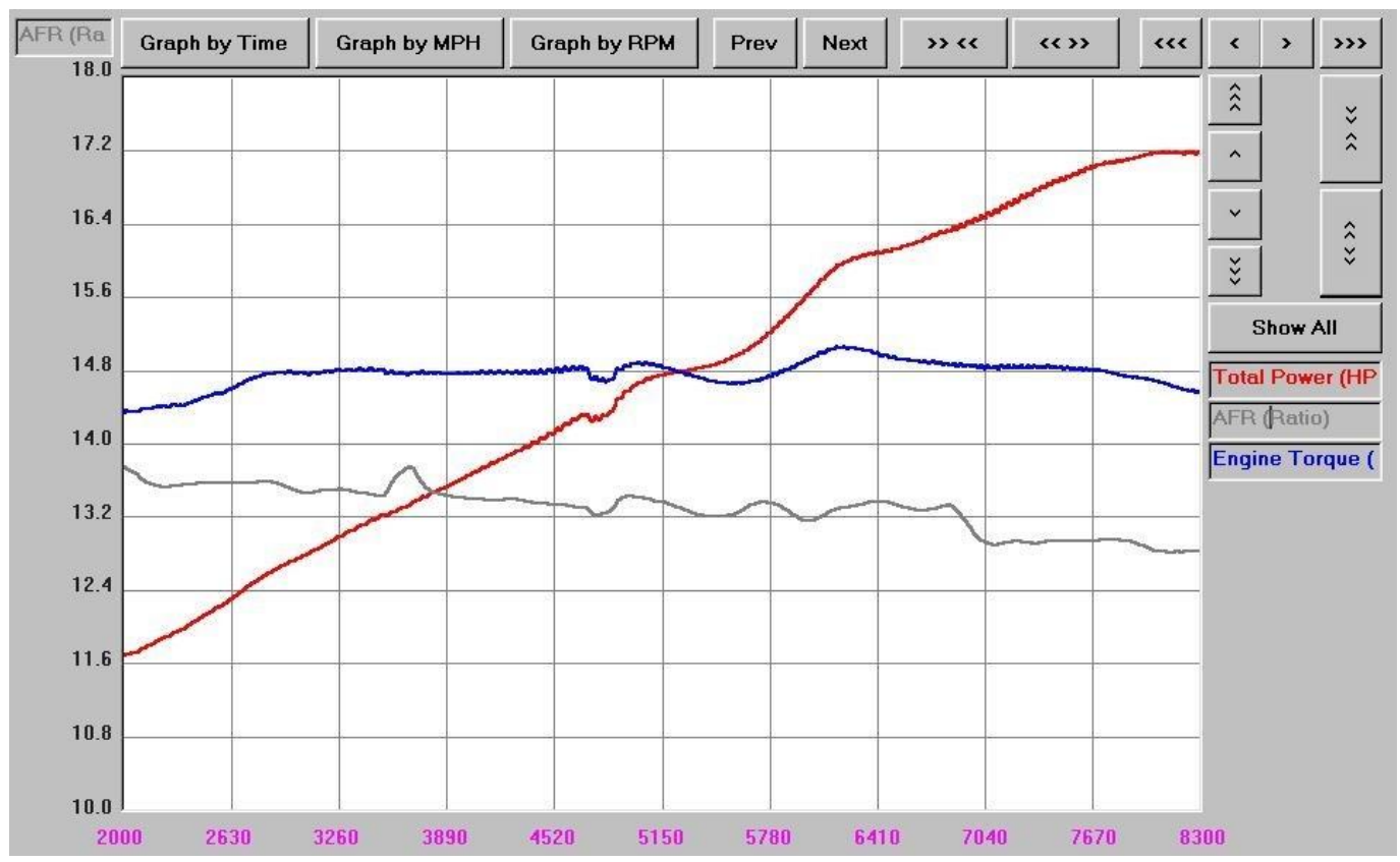
Measured Wheel Torque = blue, calculated wheel HP = red, measured relative pressure (boost) = green, grey = measured AFR