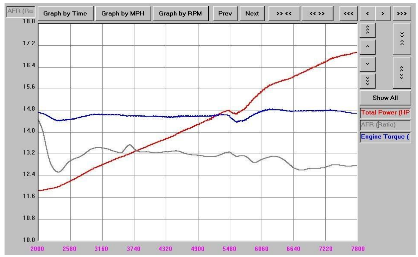
Measured Wheel Torque = blue, calculated wheel HP = red, measured relative pressure (boost) = green, grey = measured AFR Dyno Graph = Stage1+AEMSRI v100 with A/F Tracing

The above dyno graph demonstrates the fuel curve that should be measured from a sealed exhaust stream. The RPM reference can be found on the X-axis in pink numbers; the A/F Ratio reference can be found on the Y-axis in black numbers. If your fuel curve is not within +/- .5 A/F from this calibration, while running the Stage1+INSRI v103 calibration on your USDM/CDM 2006-2009 Honda Civic Si, then you may need to have the vehicle analyzed by a professional tuning facility. Hardware such as other intake systems, headers, and catless race pipes can skew the MAF sensor signal and/or create a dangerously lean fuel curve. This calibration has been established to run with the INJEN SRI system only .