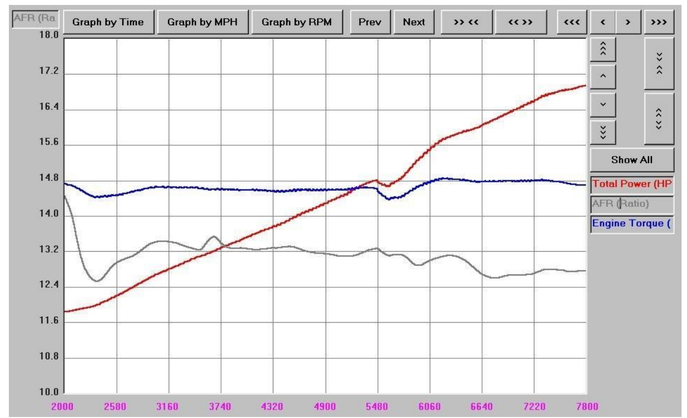
Measured Wheel Torque = blue, calculated wheel HP = red, measured relative pressure (boost) = green, grey = measured AFR Dyno Graph = Stage1+AEMSRI v100 with A/F Tracing

The above dyno graph demonstrates the fuel curve that should be measured from a sealed exhaust stream. The RPM reference can be found on the X-axis in pink numbers; the A/F Ratio reference can be found on the Y-axis in black numbers. If your fuel curve is not within +/- .5 A/F from this calibration, while running the Stage1+FUSRI v103 calibration on your USDM/CDM 2006-2009 Honda Civic Si, then you may need to have the vehicle analyzed by a professional tuning facility. Hardware such as other intake systems, headers, and catless race pipes can skew the MAF sensor signal and/or create a dangerously lean fuel curve. This calibration has been established to run with the Fujita SRI system only .